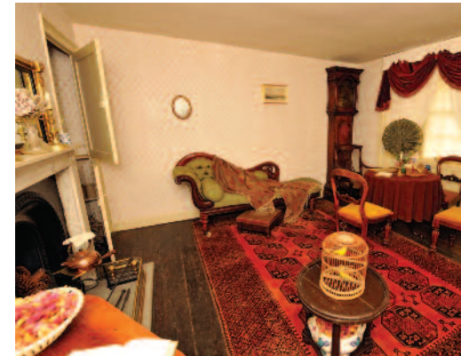
Betsey Trotwood's Parlour, Dickens House Museum