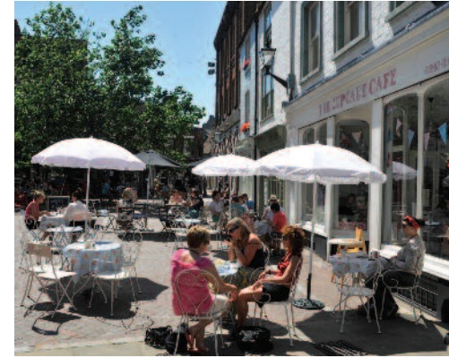
Margate Old Town