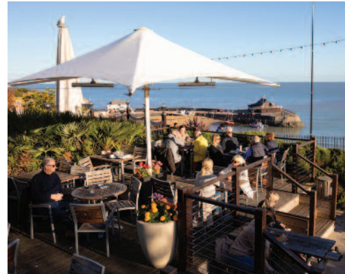
Overlooking Viking Bay