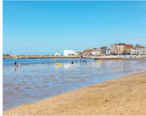
Margate Main Sands