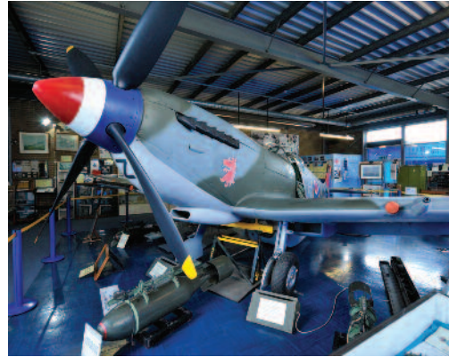
Spitfire and Hurricane Memorial Museum