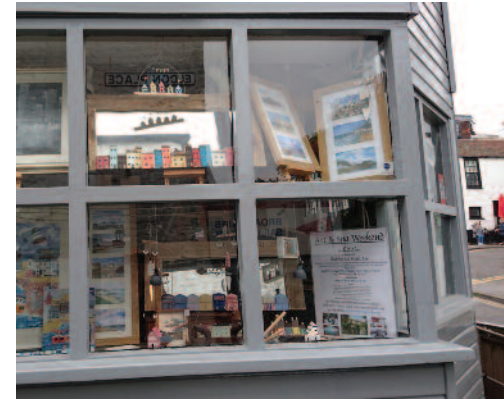
The Little Art Gallery

(2019 Awards applied for and awaiting confirmation)