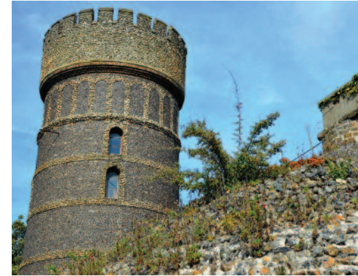
Crampton Tower Museum

Six new escape rooms in Retreat House - see New for 2019 on page 10.