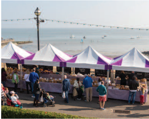
Broadstairs Food Festival