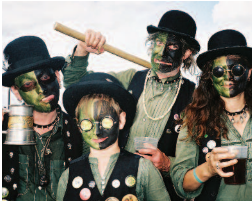
Broadstairs Folk Week - ©Dan Bass