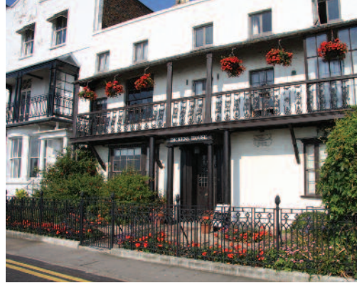
Dickens House Museum