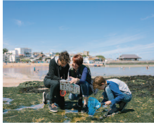
Coastal Explorer Packs

Louisa Bay – a small popular Seaside Award, bay with refreshments nearby for when the tide is high and the beach is washed clean by the sea. Sand and delightful rockpools.