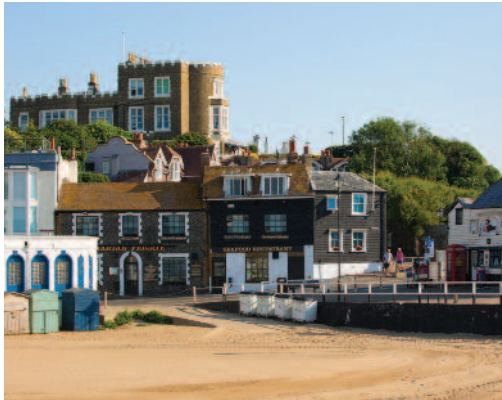
Bleak House and Viking Bay