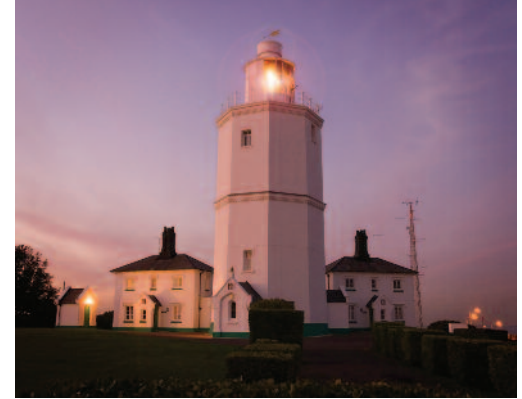
North Foreland Lighthouse