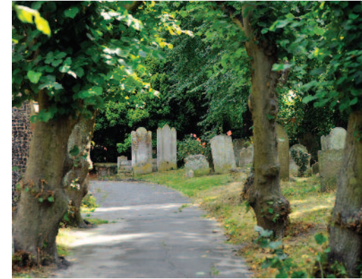
St. Peter's Churchyard