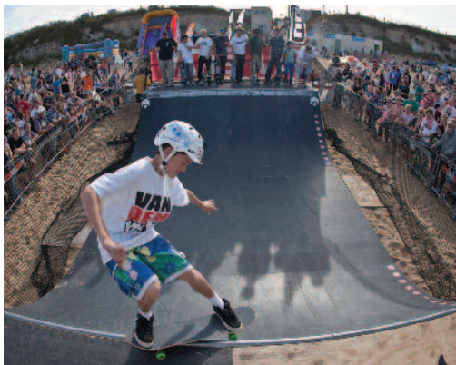
Wheels and Fins