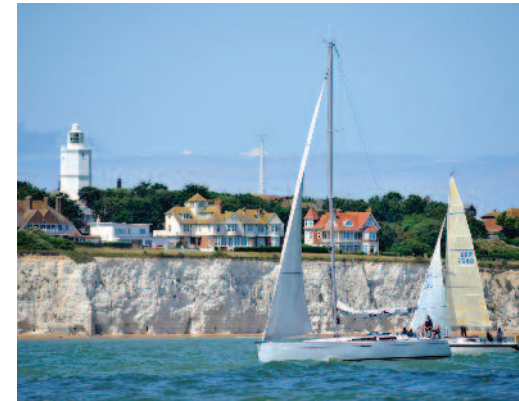
North Foreland Lighthouse