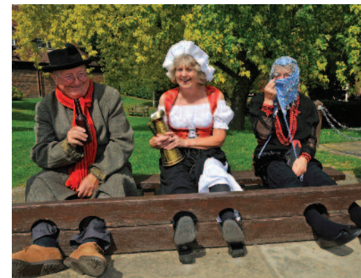
St. Peter's Village Tour