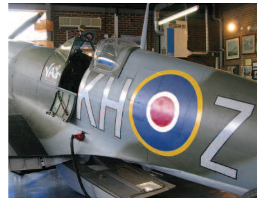
Spitfire and Hurricane Museum