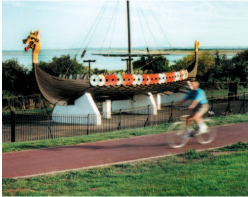
Viking Ship Hugin