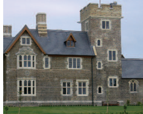
Pugin's The Grange