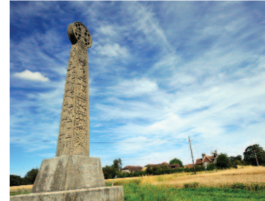
St Augustine's Cross