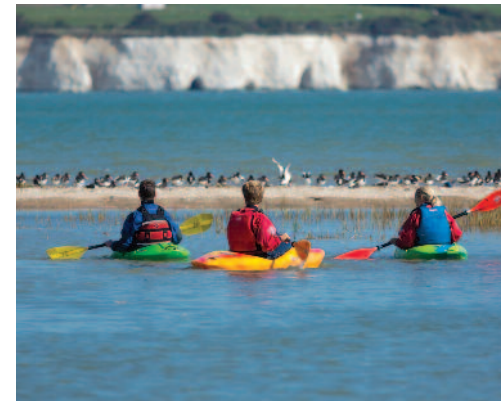
Guided canoe trip

Golfing opportunities include St. Augustines Golf Club ( www.staugustinesgolfclub.co.uk ), Manston Golf Centre ( www.manstongolfcentre.co.uk ) and Stonelees ( www.stonelees.com ). There is also the newly opened Rascal Bay Mini Golf featuring huge dinosaurs.