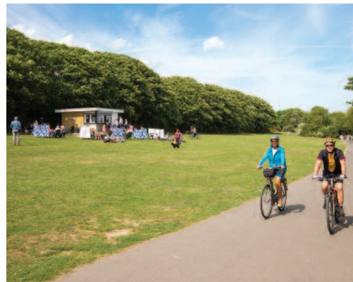
King George VI park

Boat trips – see the seals on the Goodwin Sands, admire the beauty of one of the world's largest offshore windfarms, tour the harbour or go fishing. www.ribrequest.com/ www.seasearcher.co.uk