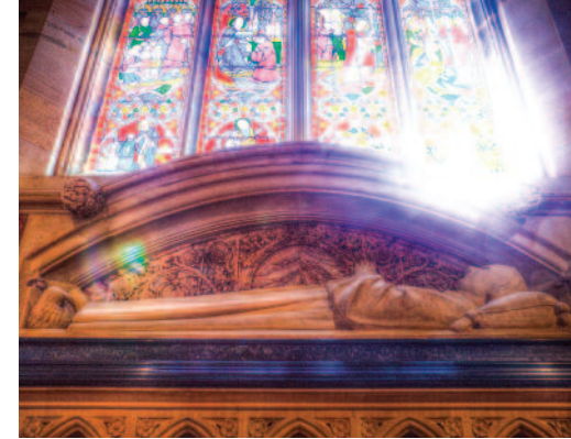
St. Augustine's Church