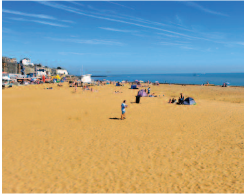
Ramsgate Main Sands