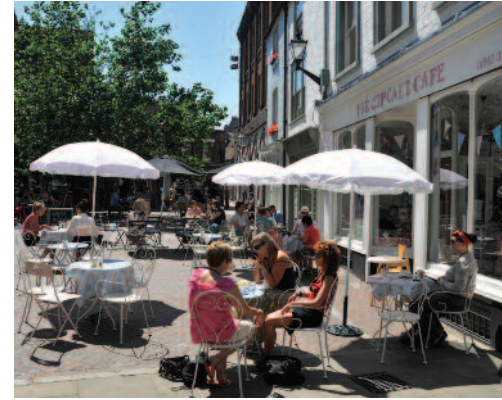
Margate Old Town