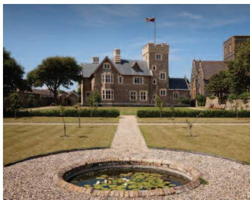
Pugin's The Grange