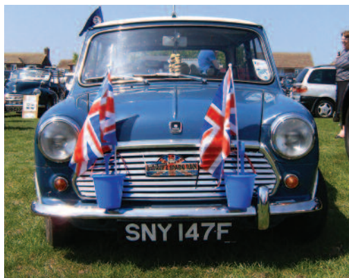
Great Bucket and Spade Run