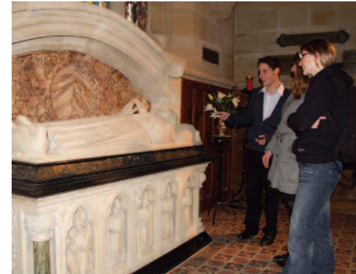
Pugin Tomb at St. Augustine's Church.