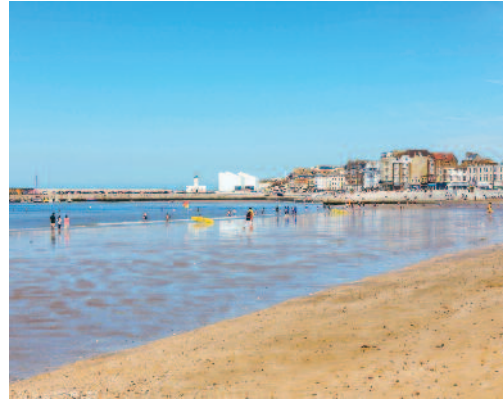
Margate Main Sands