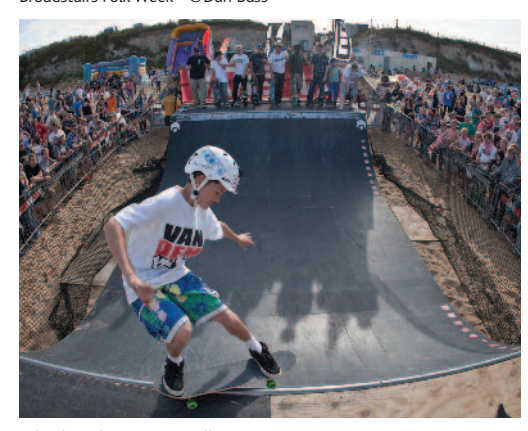
Wheels and Fins