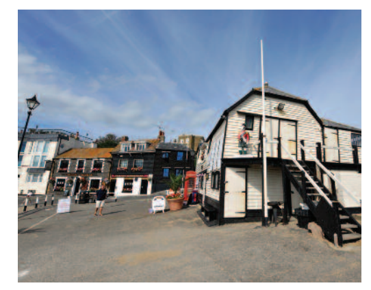
Harbour Master's Office