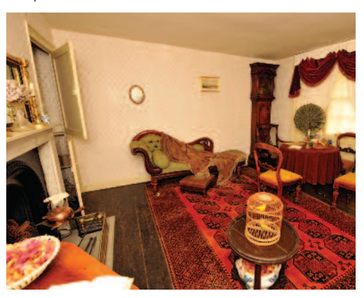
Betsey Trotwood's Parlour, Dickens House Museum