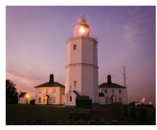
North Foreland Lighthouse