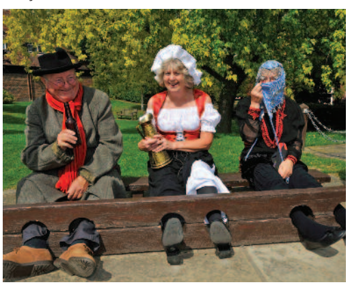
St. Peter's Village Tour