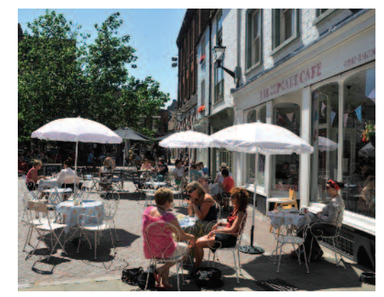
Margate Old Town