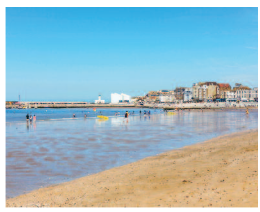
Margate Main Sands