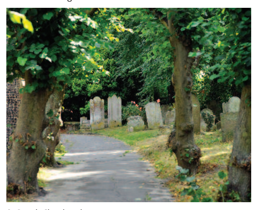
St. Peter's Churchyard