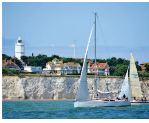
North Foreland Lighthouse