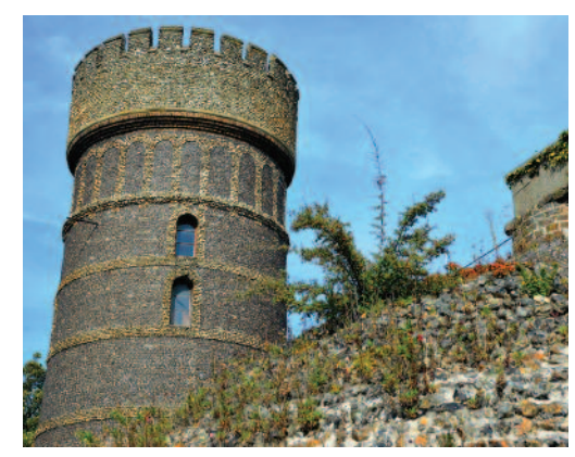
Crampton Tower Museum

(www.minigolfbroadstairs.com) A championship designed mini-golf course, complete with tea garden.