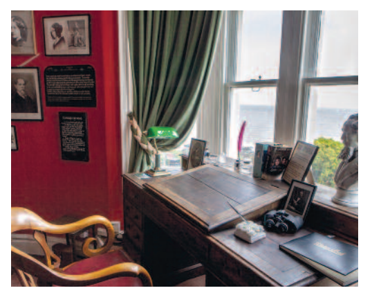
Charles Dicken's Study. Bleak House