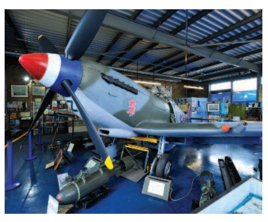
Spitfire and Hurricane Memorial Museum