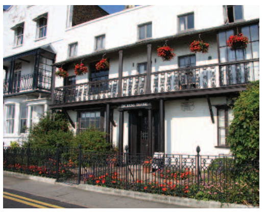
Dickens House Museum