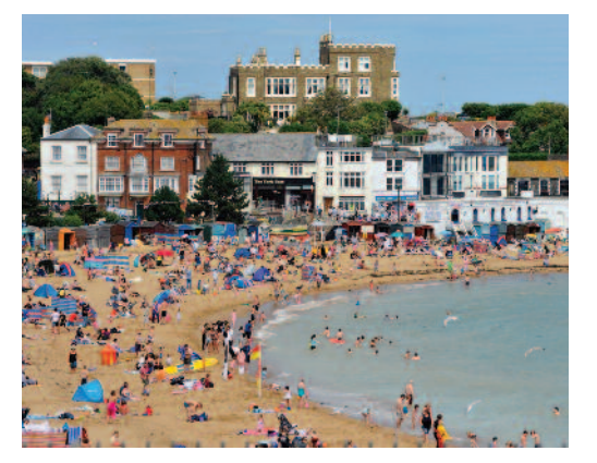
Viking Bay, Broadstairs

Miles of low chalk cliffs edge the peninsula, sheltering a string of secluded , unspoilt sandy bays . Chalk rockpools , chalk stacks and rare