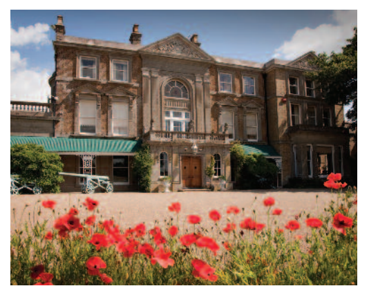
Powell-Cotton Museum and Quex House, Birchington