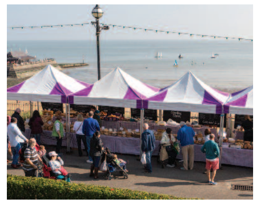
Broadstairs Food Festival

Find full details of Thanet's accredited accommodation at www. visitthanet .co.uk/plan-your-visitintroduction/places-to-stay