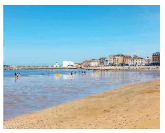
Margate Main Sands