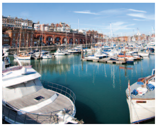
Royal Harbour, Ramsgate