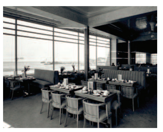
Original Sunshine Café

The Grade II listed building is being developed by JD Wetherspoon into a public house, with additional commercial uses. The building is owned by Thanet District Council and a lease has been agreed with JD Wetherspoon. Applications are currently under consideration for planning permission and listed building consent, to include the refurbishment of the interior and exterior of the building.