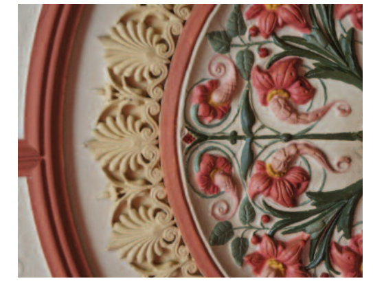
Original features, 12 Arthur Road