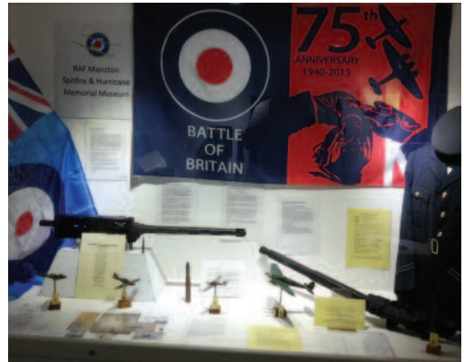
Defence of the Nation Education Museum, Ramsgate