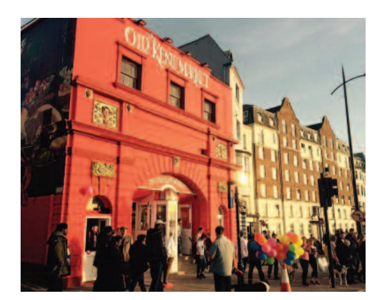
Old Kent Market, Margate