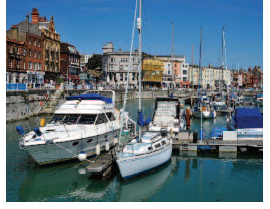
Royal Harbour, Ramsgate