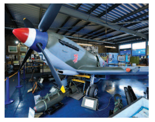
Spitfire and Hurricane Memorial Museum

Just a short distance from the coast visitors discover a treasure chest of delights in Thanet's traditional villages.