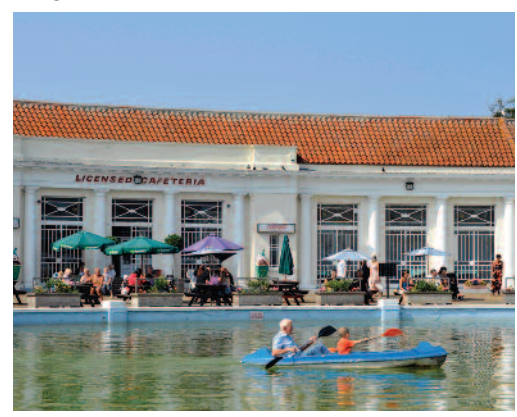
The Boating Pool