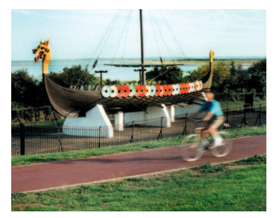
Viking Ship Hugin