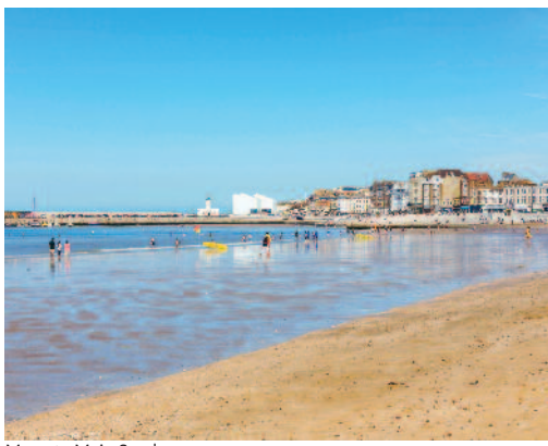
Margate Main Sands