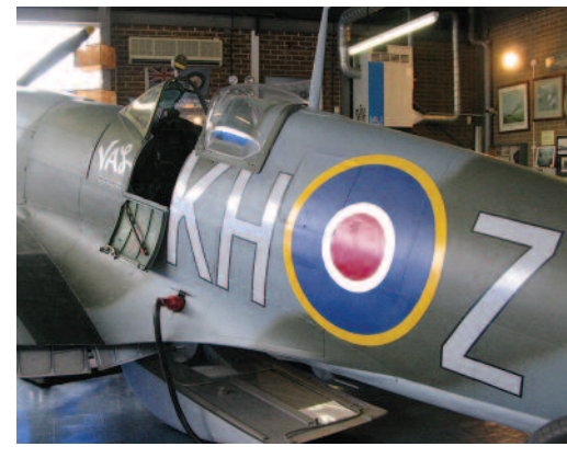
Spitfire and Hurricane Museum