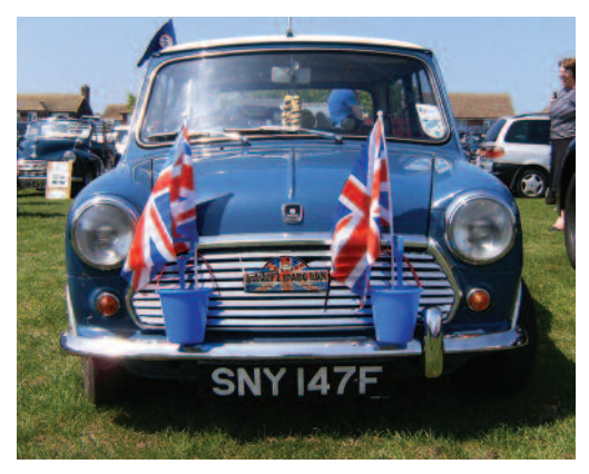
Great Bucket and Spade Run