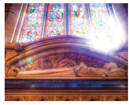
St. Augustine's Church