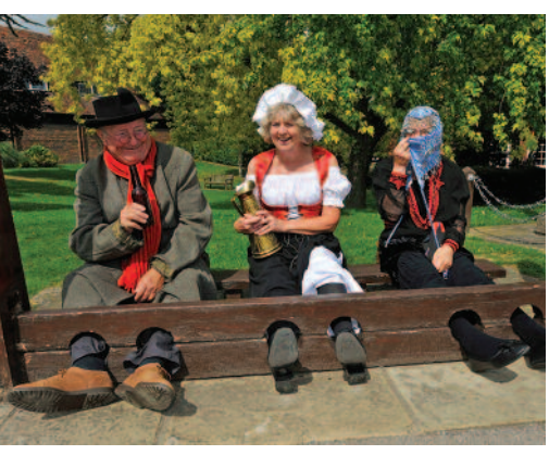
St. Peter's Village Tour