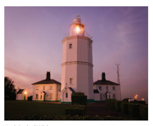
North Foreland Lighthouse