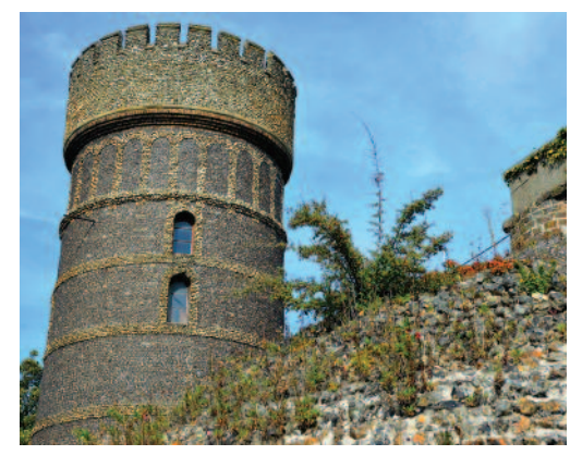
Crampton Tower Museum

www.minigolfbroadstairs.com A championship designed mini-golf course, complete with tea garden.