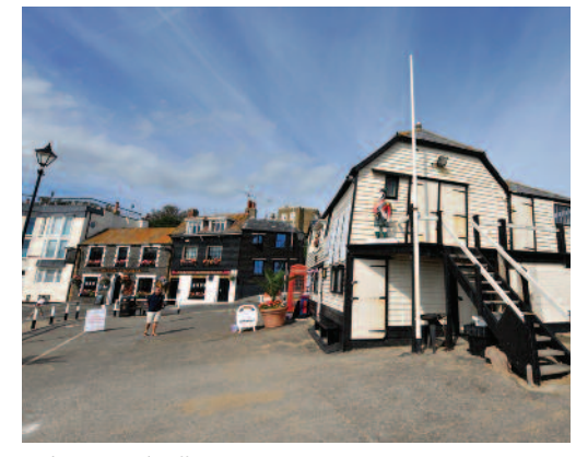
Harbour Master's Office