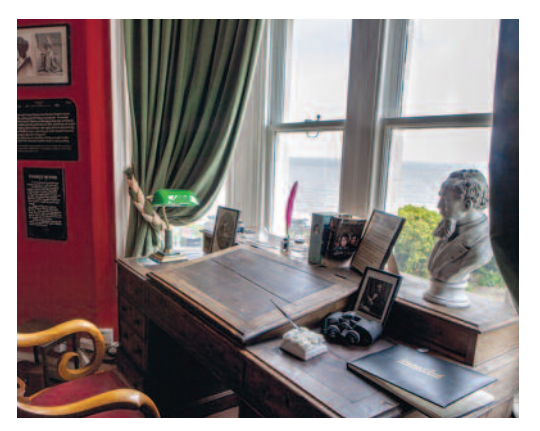
Charles Dicken's Study. Bleak House