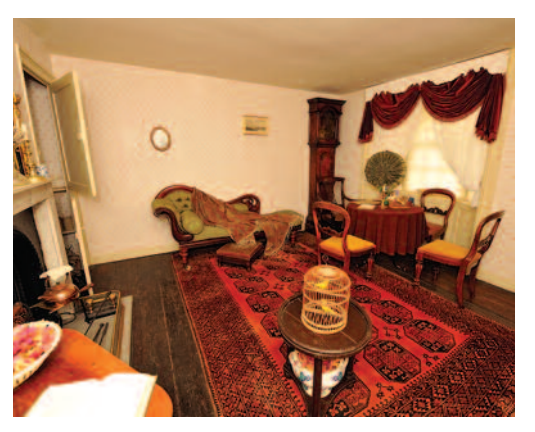
Betsey Trotwood's Palour, Dickens House Museum