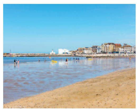
Margate Main Sands