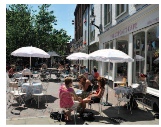
Margate Old Town