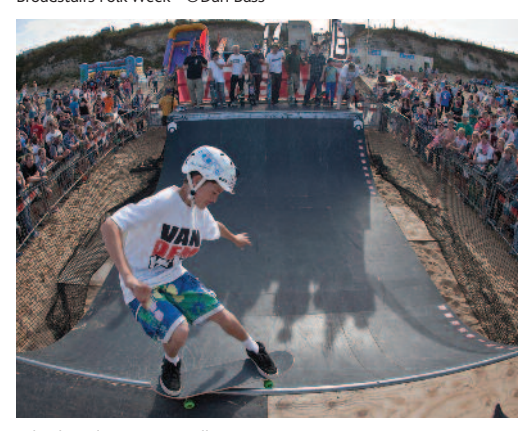
Wheels and Fins