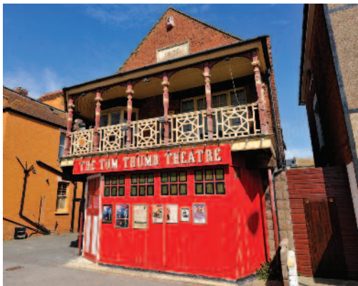
Tom Thumb Theatre

( www.tomthumbtheatre.co.uk ) – one of the smallest theatres in the world created in a former coach house. Look out for comedy nights, burlesque, off-beat cinema, live music and more.