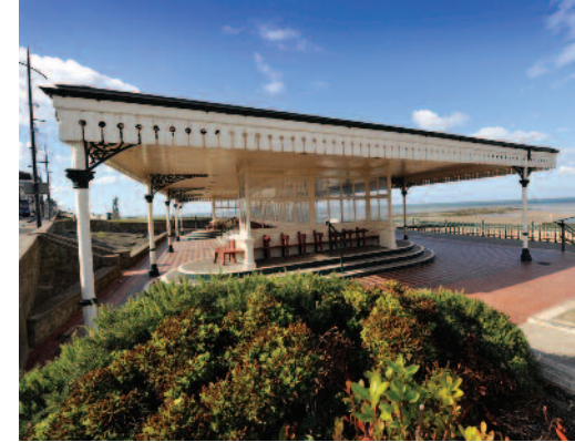
T.S. Eliot shelter