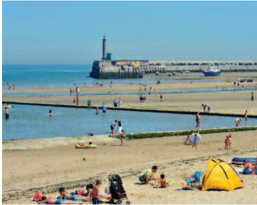
Margate Main Sands