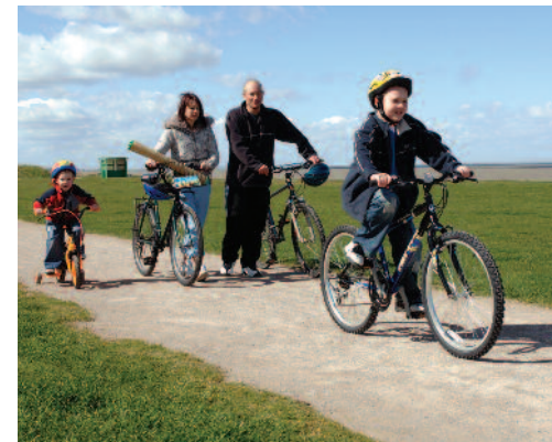
Viking Coastal Trail at Minnis Bay