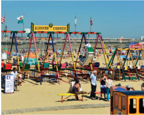
Margate Main Sands - children's rides