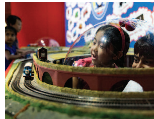
Hornby Visitor Centre